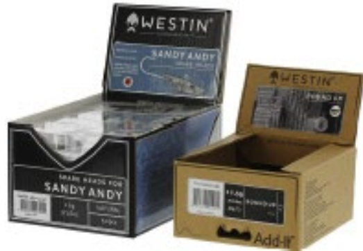
Downsizing the boxes and removal of plastic packaging material