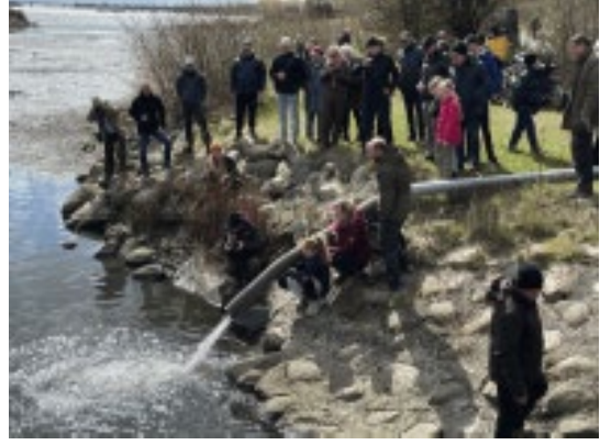
Unleashing 20.000 trouts in Harrestrup Å

Fairpoint has in the beginning of 2022 supported the foundation of Dansk Lystfiskeri.